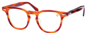
CLASSIC BLONDE (N/A)