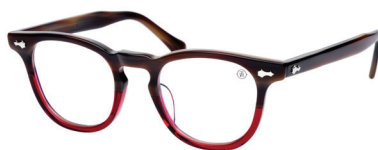
MOCHA ROSA (USD475)