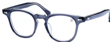
GREY CLEAR (USD475)