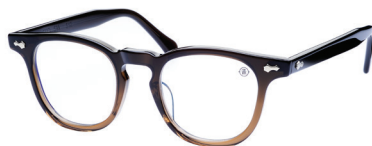
BROWN COMBO (USD475)