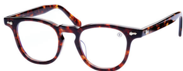
ANTIQUÉ TORTOISE (USD475)