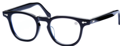
CLASSIC BLACK (USD475)