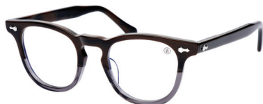
MOCHA FADE (USD475)