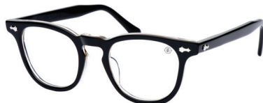
BLACK COMBO (USD475)